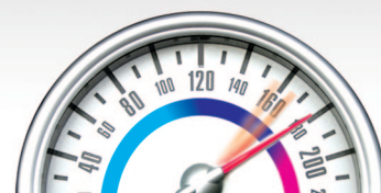
Improved memory bandwidth