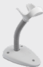
▪ STD-QD24-WH Stand, White