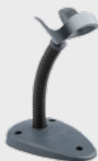
▪ STD-QD24-BK Stand, Black