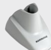
▪ STD-AUTO-QD24-WH Stand, White