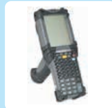
Data terminals & PDA