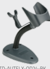
▪ STD-AUTFLX-QD24-BK Autosense Flex Stand, Black