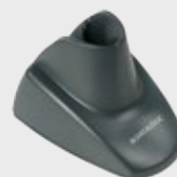
▪ STD-AUTO-QD24-BK Stand, Black